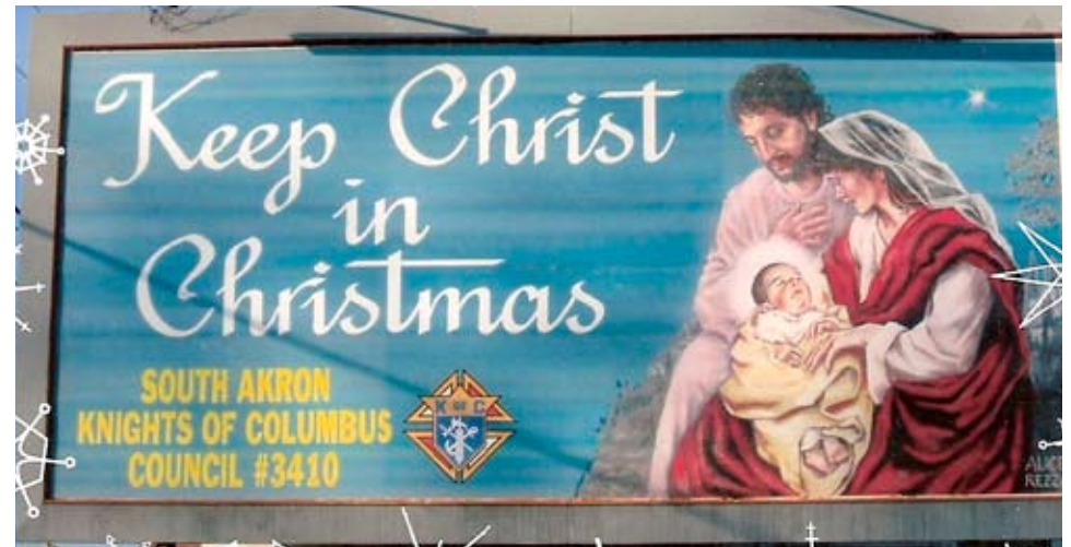
Akron Council 3410's Keep Christ in Christmas billboard was one of many scattered around Ohio.