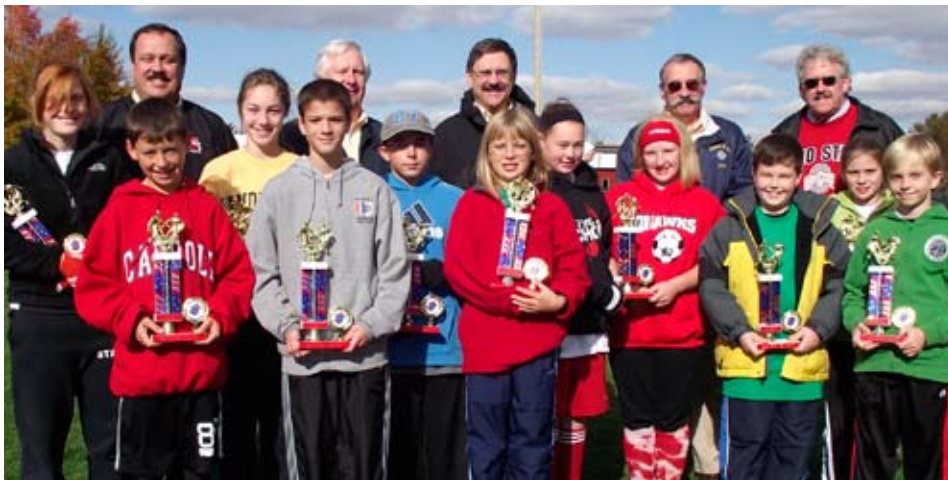
The 2010 Soccer Challenge champions, with State Officers.