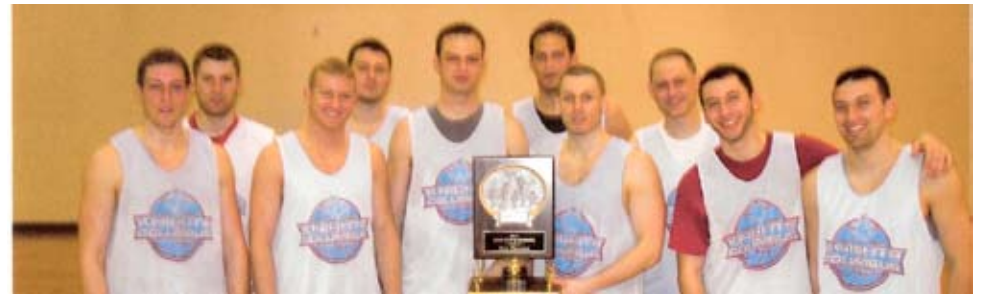
The Lima Council basketball team, 2011 Ohio K of C champions.

It will be Knights of Columbus Sunday at the Sorrowful Mother Shrine near Bellevue (Toledo Diocese) on Sept. 25. Knights, their families and friends are invited to celebrate the 11 a.m. Mass. The Shrine is located at 4106 SR 269 north, Bellevue, OH 44811 (419) 483-3435.