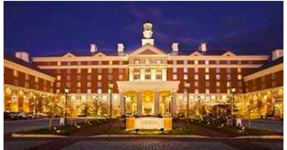
The Hilton Columbus at Easton Hotel

Now comes the most satisfying part of my job -- having the honor at the State Convention Awards Session of announcing the hundreds of awards which will be given to individuals and councils for the dedication and hard work they have exhibited during the 2010-2011 fraternal year.